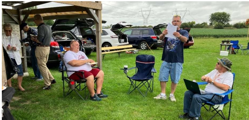
Let the meeting begin!