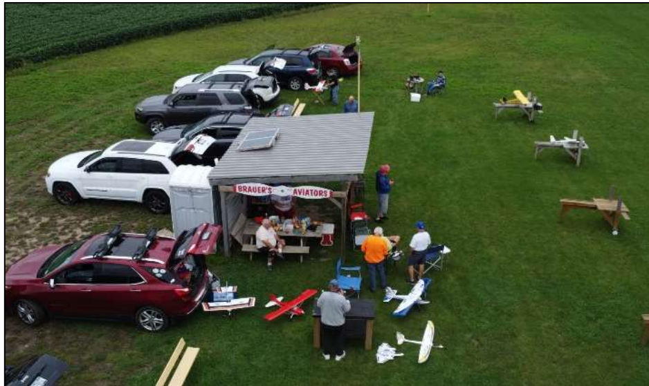
Bird's eye view