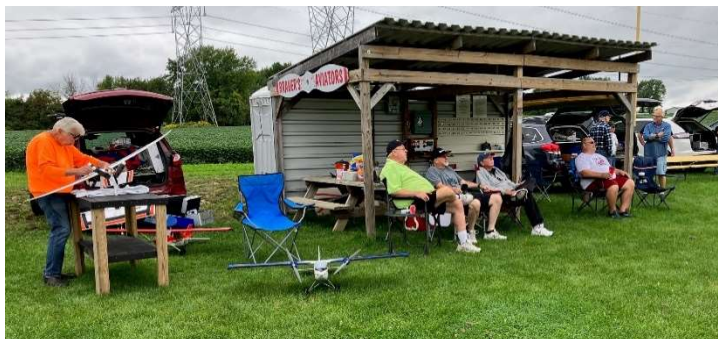
Who's turn was it to watch Walt?