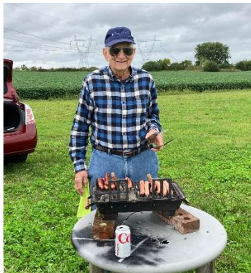
Fly a plane, get a hot dog.