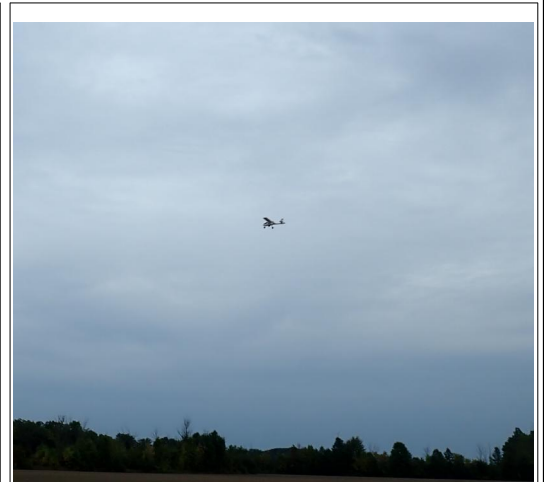
As Brian would say "Tail side up"