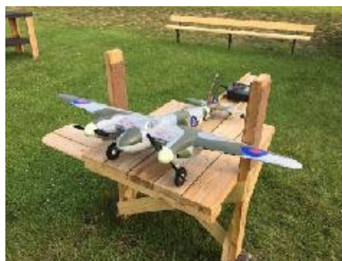
Joe Suarez's Mosquito.

With all the rain this year we've been receiving reports of big Mosquitoes at the field. You may want to keep a can of insect repellent in your flight bag or a Fw 190 in case you run into one of these fellas. ➔